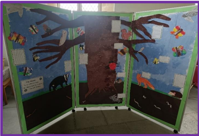
Gruffalo's Woodland Display at St Mary's Church Come and see our lovely artwork!